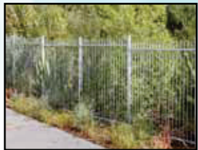
Bastion 1850 Panel 1.850 High x 2.400 Long (Arrow Top)