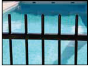
Cambridge 1250 Panel 1.250 High x 2.400 Long