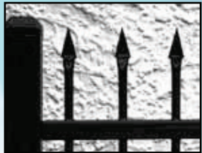
Bastion 1550 Panel 1.550 High x 2.400 Long (Arrow Top)