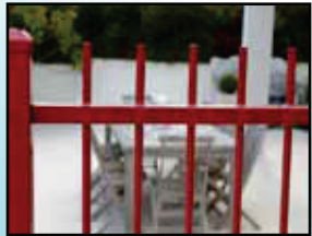
Cambridge 1500 Panel 1.500 High x 2.400 Long