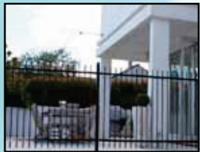
Cambridge 1800 Panel 1.800 High x 2.400 Long