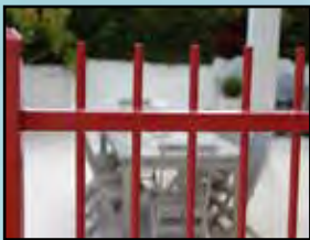
Anchor Cambridge Panels (Tubular)

1.250m High x 2.400m Long 1.500m High x 2.400m Long 1.800m High x 2.400m Long