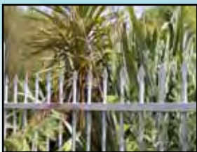
Anchor Bastion Panels (Tubular with Arrow Head)

1.250m High x 2.400m Long 1.500m High x 2.400m Long 1.800m High x 2.400m Long