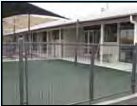
Anchor Double Driveway Gate