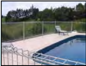
Anchor Pool Panel (Steel Rod, Folded Top/Base)