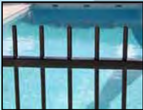
Anchor Cambridge Gates (Tubular)

Pedestrian or Driveway Custom made to your site