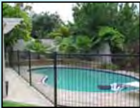
Anchor Vista Panel (Steel Rod 25mm Tube Top/Base)