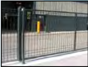
Anchor Sliding Driveway Gate