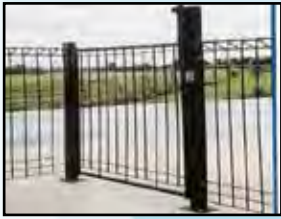
Anchor Pool or Vista Gate