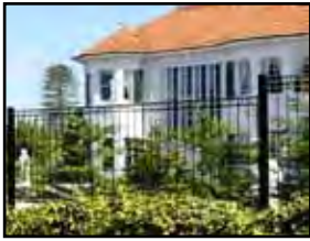
Anchor 1250 Panel (Steel Rod, Folded Top/Base)