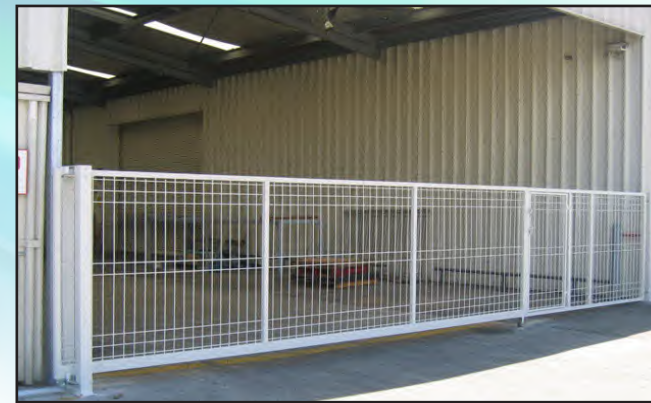
Anchor Safeguard Sliding Gate