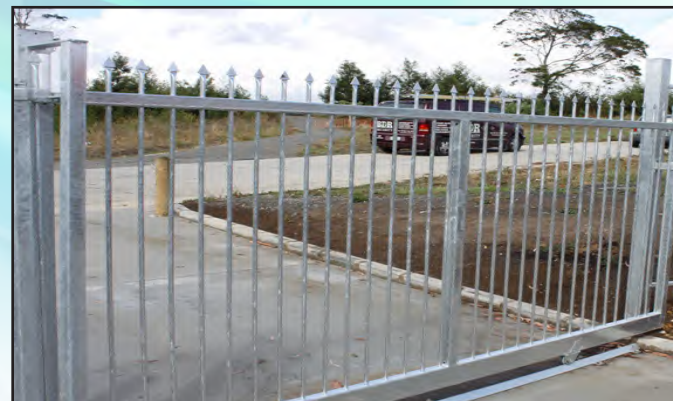
Anchor Bastion Sliding Gate