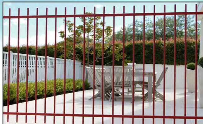
Anchor Cambridge Gate

All Anchor gates are Made in New Zealand and treated locally to these standards; Hot Dipped Galvanised Finish AS/NZS 4680:2006 Powder Coated Finish AS/NZS 4506:1998