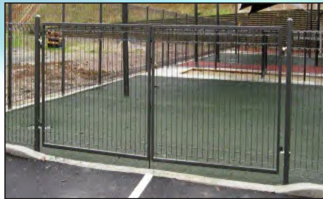
Anchor Playcentre Double Gate

All Anchor gates are Made in New Zealand and treated locally to these standards; Hot Dipped Galvanised Finish AS/NZS 4680:2006 Powder Coated Finish AS/NZS 4506:1998