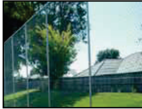
Anchor Galvanised Chain Link 50mm diamond