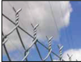
Anchor Galvanised Chain Link 50mm diamond - with "Barbed Top"