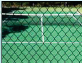
Anchor Black PVC Coated Galvanised Chain Link 50mm diamond