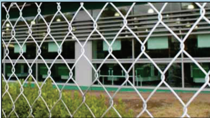
Anchor Galvanised Chain Link

We utilise galvanised wire conforming to the stringent New Zealand Standard "NZS 3471 : 1974".