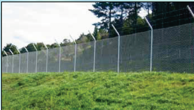
Whangarei Refuse Centre, Anchor Galvanised Chain Link & Anchor Barbed Wire, Iowa Pattern